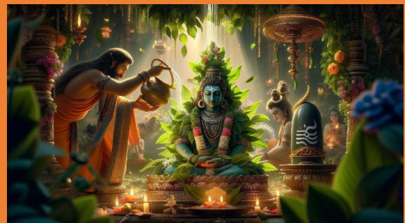
Shiv Ji Aarti