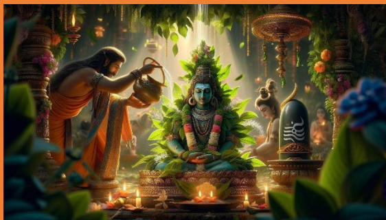
Shiv Ji Aarti