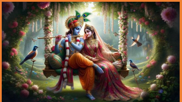
Shri Krishna Chalisa