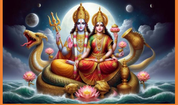
Shri Vishnu Sahasranam Stotra