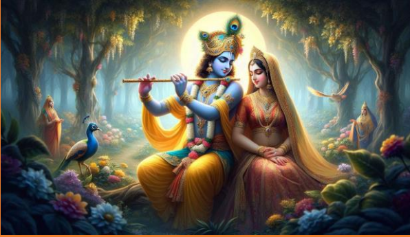
Shri Krishan Ji 108 Names