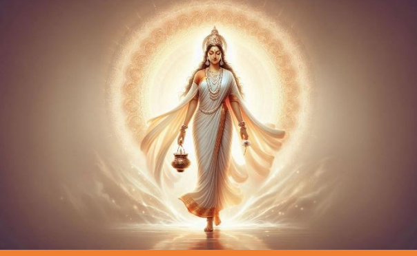
Maa Brahmacharini Aarti