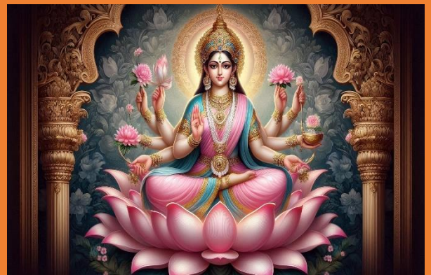
Maa Siddhidatri Stotra